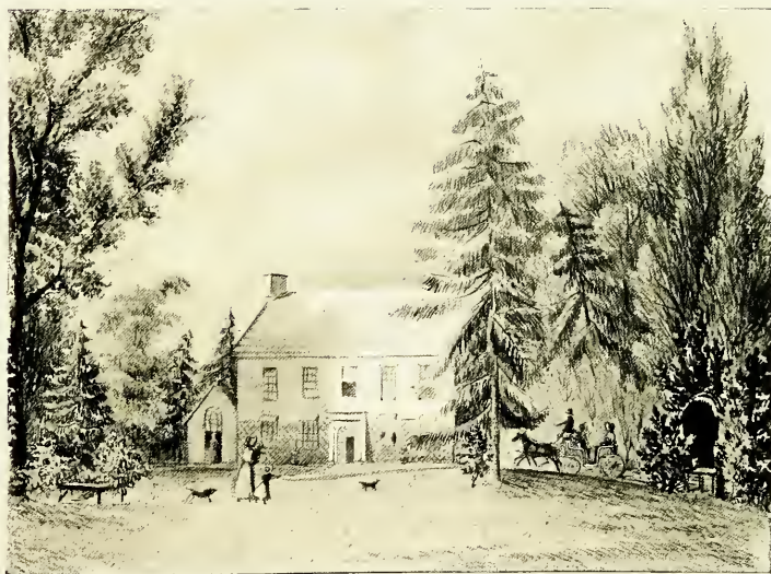
HEATH'S COURT, OTTERY ST. MARY, 1829