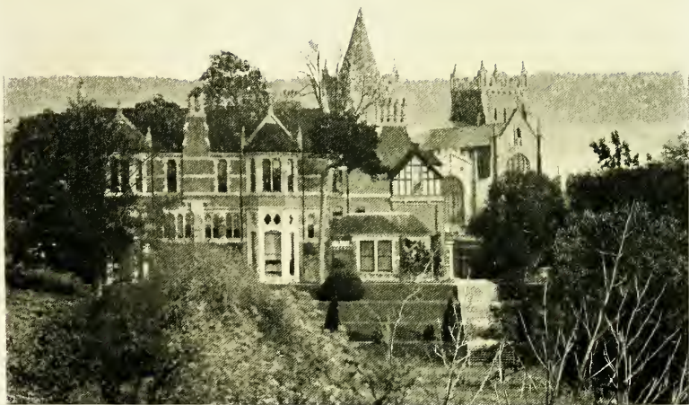
HEATH'S COURT (NOW CHANTER'S HOUSE), OTTERY ST. MARY, FROM THE HILL