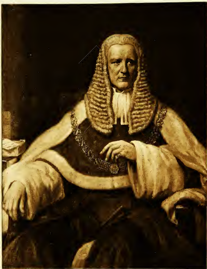
Portrait of Lord Coleridge aet 57 From an oil painting by E. U. Eddis.