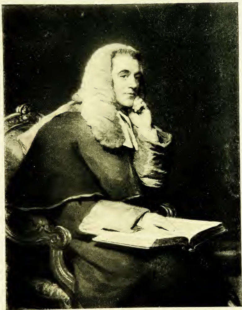
PORTRAIT OF SIR JOHN TAYLOR COLERIDGE